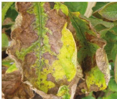
Figure 5.1 Potash deficiency

The amount of potash recommended at K Index 2 will only replace the amount removed by a 50 t/ha crop and potash should be applied for the next crop in the rotation to maintain the soil at K Index 2. The extra amounts of potash shown for K Index 0 and 1 soils will slowly increase the soil K Index.