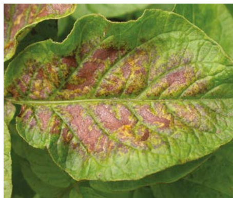
Figure 5.2 Magnesium deficiency