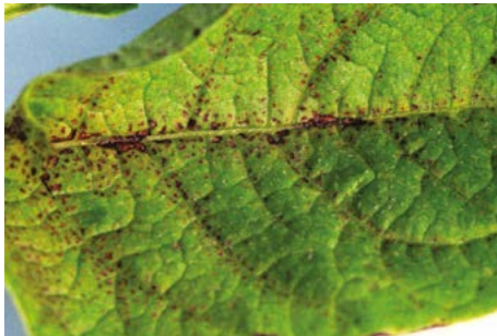
Figure 5.4 Manganese deficiency

Potatoes can tolerate a degree of soil acidity and are best grown at soil pH levels that are lower than for most other arable crops. However, liming immediately before potatoes should be avoided unless the soil pH is very low, as this can increase the risk of common scab and manganese deficiency.