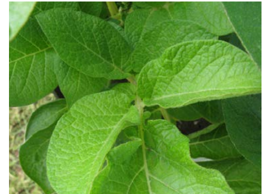
Figure 5.3 Sulphur deficiency

Farmers are advised to monitor the sulphur requirements of their crops. Where sulphur deficiency has previously occurred or is expected, apply 25 kg SO_3 /ha as a sulphate-containing fertiliser in the seedbed.